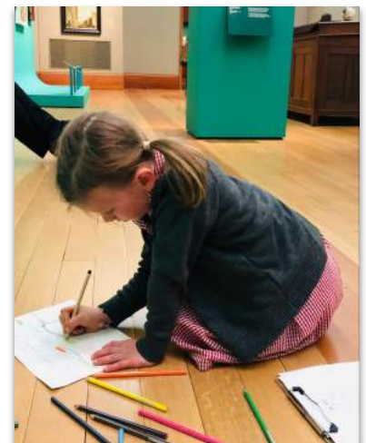
Upper Prep pupils enjoy a trip to the Fitzwilliam on a Wednesday afternoon.